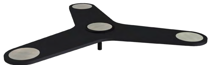
Orientation measurement adapter for simultaneous determination of mirror support position and angle

QFoto has demonstrated reliable operation in collector assembly lines in Europe, North and South Africa, Asia and North America.