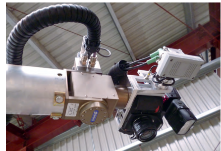
Measurement camera with flash on pan-tilt-roll head, mounted on rotary arm above structure

QFoto measurement summary example for parabolic trough structure from data evaluation report