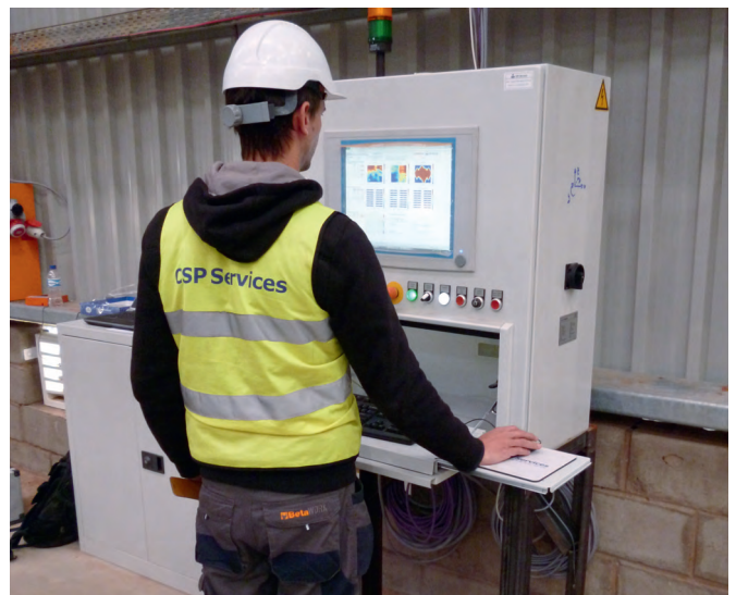
Control cabinet for automatic measurement, evaluation and output with signal light for pass or fail result

QFoto works with custom-made high-precision measurement targets and adapters with retro-reflective surfaces for any concentrator type. Specific and robust targets and adapters are available for mirror support positions and angles, for receiver support and rotation axis positions and for other relevant module dimensions. After each measurement, an evaluation report summarizes the main results for all coordinates as well as mirror tilt angles, mirror support angles and distances, including measurement accuracy check. The quality assessment according to defined tolerances evaluates the pass/fail rating for the whole module and indicates it to the operators by a signal light. The output includes statistical quality analysis of the production period.